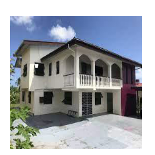
Big double storey concrete houses