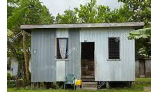
Tin /corrugated houses