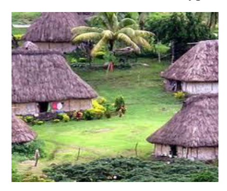
Thatched bure houses in Navala Village Ba