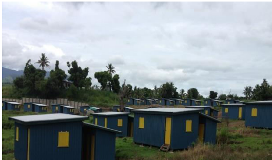
Koropita charitable homes