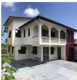
Big double storey concrete houses