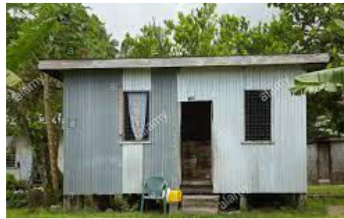
Tin /corrugated houses