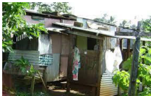
Squatter settlement houses