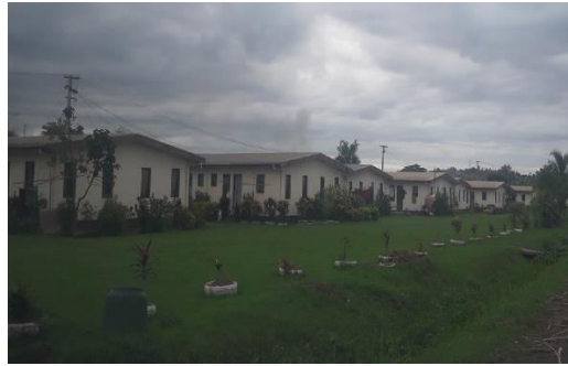
Lovu Heart Homes