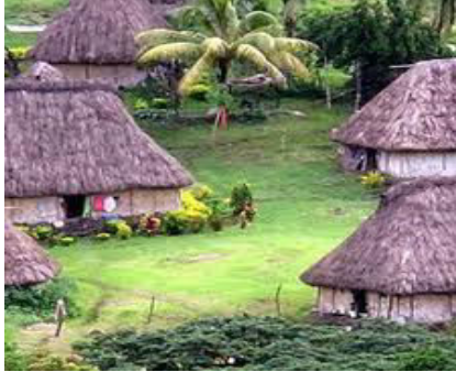
Thatched bure houses in Navala Village Ba