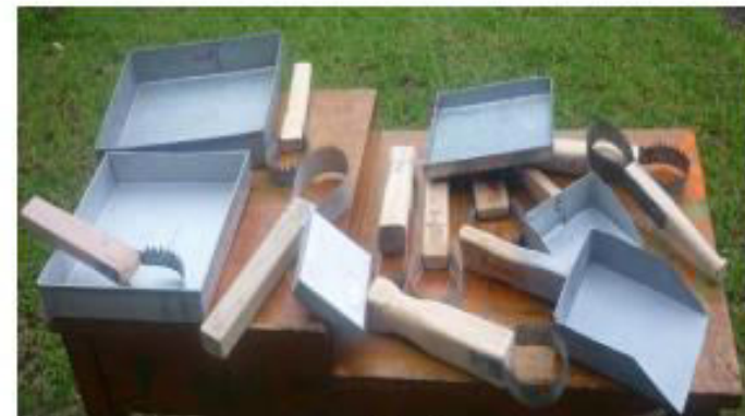
Fish scale remover and dust pan.