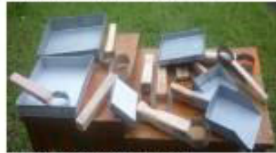
Fish scale remover and dust pan.