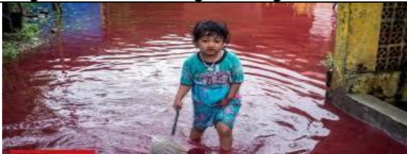
Do not play in flooded areas.

Things not to do during flooding and hurricanes.