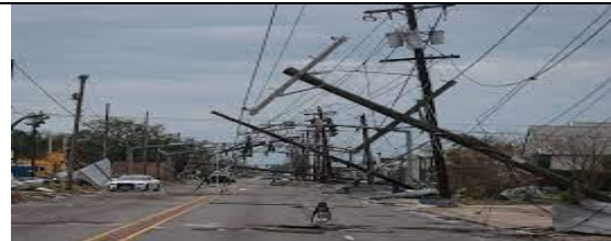
Do not play with power lines.