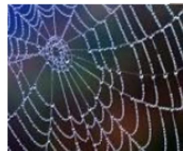
A spider's web