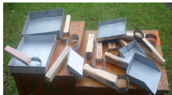
Fish scale remover and dust pan.