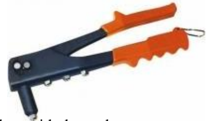
A pop-rivet gun

Pop rivet guns can be very inexpensive to use as are the rivets. You can buy with the tool or separately. It may be beneficial to get a good quality rivet tool from the start, however a cheaper one will be sufficient depending on the work at hand.