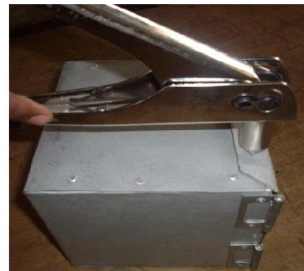
Drilling for rivet Inserting rivet to Riveting pop rivet gun