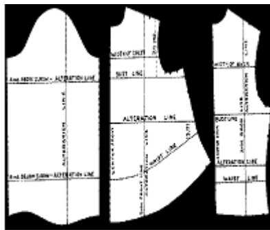
Lesson 20 • Illustration XX-1

The New York Times is a National Edition (NYC)