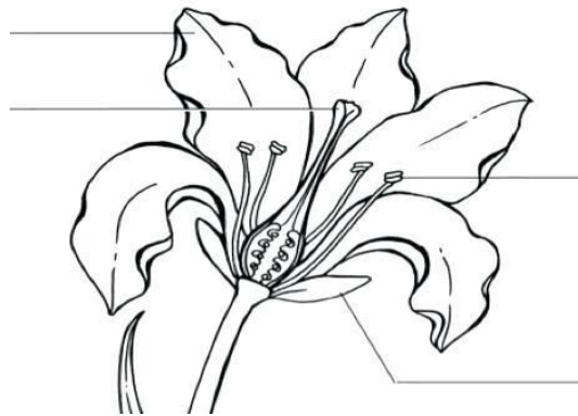
Label the Parts of the Flower

5. Name the male and female parts of a flower.